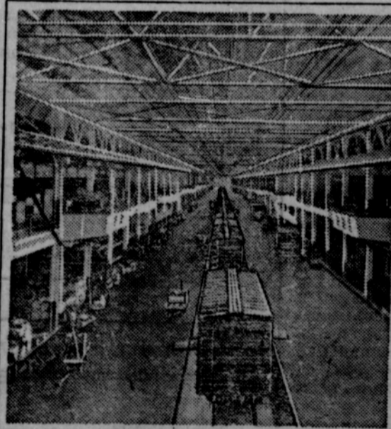
Trains unload in the plant.