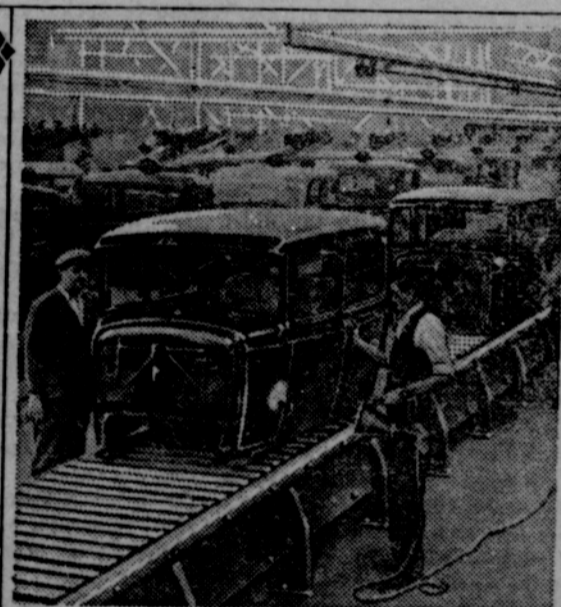
Bodies starting through the shop.