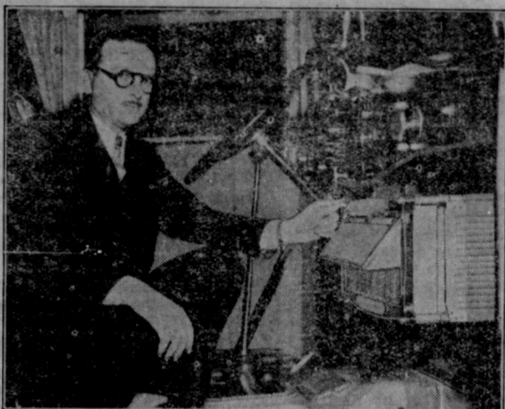
"A far cry from the old foot warmers to the modern heating and ventilating system of the Union Pacific Stages," says General Agent McCredie.

Some of us remember the old soapstone foot warmers and the hot flatirons that mothers used to wrap up in an old quilt to keep our feet warm as we drove off to town in the now extinct buggy. No matter how warm one dressed it was always a wonderful comfort to take a little heat along on winter trips.