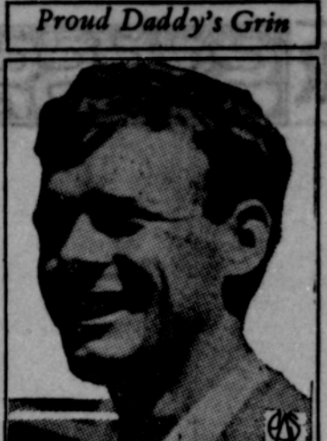
Yes, you guessed it. This is Col. Charles A. Lindbergh on the day his son was born. Lindy doesn't often smile like this.

Our prices on printing are not always the lowest... but our work is always the best