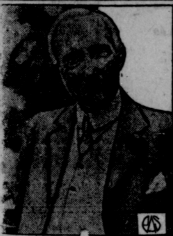
John D. Rockefeller, Sr., photographed on his 91st birthday, looks in better health than he did a year ago.

the Oasis theatre on Sunday and Monday next, all for a lady takes the steering wheel in one hand and his lifeline in the other and coars away into the peaceful heavens—upside down and then— This hilarious farce comedy, which is a continual succession of roars and gasps, presents Edward Everett Horton, the famous comedian, as "The Aviator," opposite Patsy Ruth Miller as the girl.