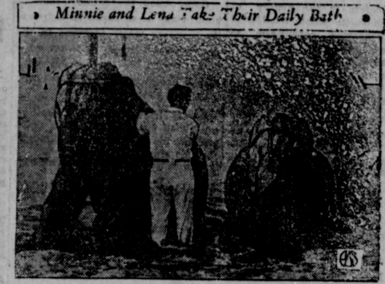
Watching the elephants go in swimming is one of the sights of Coney Island early in the morning. They like it and hate to come out.