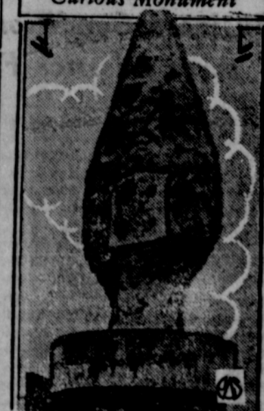
This huge copy of an Indian arrow-head has been set up at Old Fort, W. C., where an old blackhouse stood in 1756.