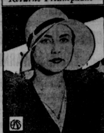
Mrs. Helen Wills Moody, world's champion tennis player, photographed on her return from her European victories.