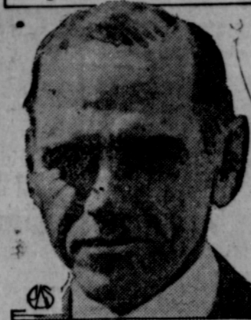
Eugene Grace, president of Bethlehem Steel Corporation, whose compensation for his work runs around $1,000,000 a year.