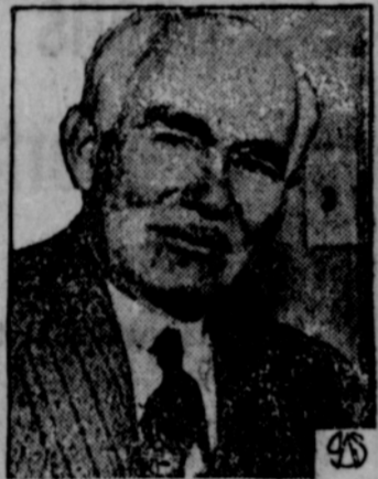
Dr. Lee De Forest, inventor of the radio "tube," whose patent on sound-film recording has been upheld by the courts.