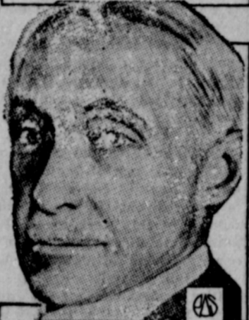
Elmer A. Sperry, inventor of gyroscopes, searchlights, electric vehicles and hundreds of other things, passed away at the age of 70.