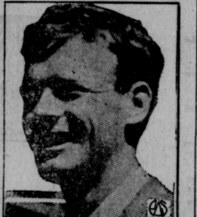
Yes, you guessed it. This is Col. Charles A. Lindbergh on the day his son was born. Lindy doesn't often smile like this.