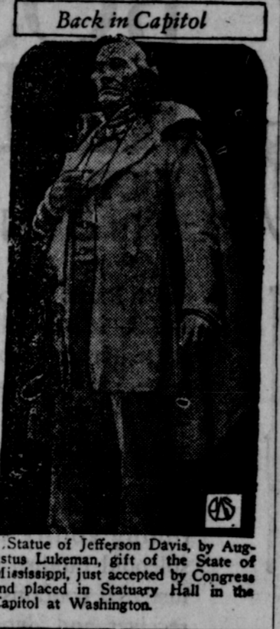
Statue of Jefferson Davis, gift of the State of Mississippi, just accepted by Congress and placed in Statuary Hall in the Capitol at Washington.

Exhibits Large Egg. F. M. Guitwits was exhibiting a White Leghorn egg in town this week which he thinks pretty close to the record for size. The egg measured 8 inches the long way and 6 1/8 inches in circumference. The egg