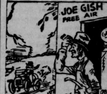
JOE GISH FREE AIR WHAT KEEPS FOLKS FROM GOIN' WRONG AIN'T ALWAYS CONSCIENCE; SOMETIMES IT'S JUST COLD FEET.

All rocks can be melted into liquids and at higher temperatures they can be changed to gas.