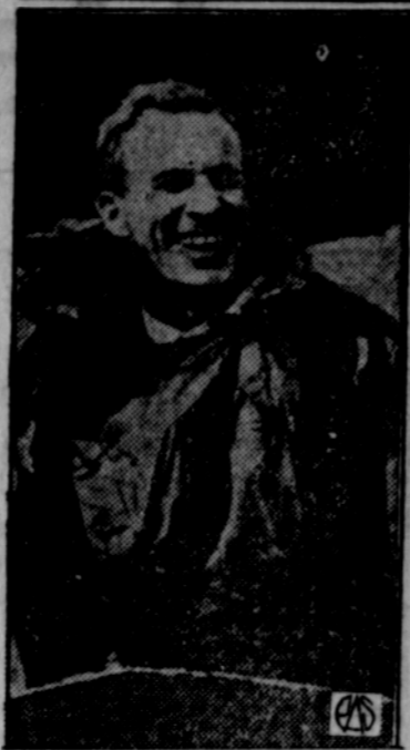
Captain Charles Kingsford-Smith, first airman to make a successful trans-Atlantic flight from East to West, as he landed in New York.