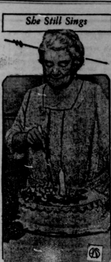
She Still Sings Mme. Ernestine Schumann-Heink, a great-grandmother, cutting her 69th birthday cake just before appearing in concert. Her golden voice is still the world's greatest contralto.

DO YOU KNOW— Modern girls will never die of broken hearts, according to an eminent doctor. Three hundred and eighty-two applications for patents were filed by English women last year. A woman, aged eighty-six, has decided to adopt modern fashions, and wears knee-length frocks. The reason it is held unlucky to spill salt is that salt is the symbol of hospitality and friendship.