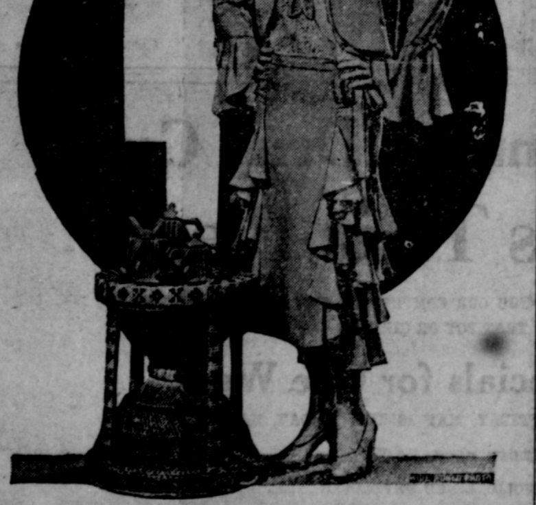
Much-Befounced Afternoon Dress.

Therefore it becomes evident that women of fashion are expected to own "oodles" of blouses both fancy and