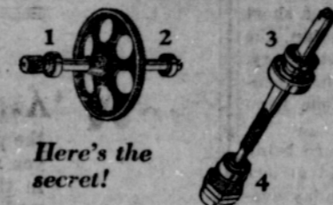
Here's the secret!

It's the combination of high-grade ball bearings (at the vital points 1, 2, 3, and 4) and positive, automatic lubrication, that makes the McCormick-Deering so easy to turn. A gleaming, japanned finish and a special disk-removing rod makes it easy to keep the McCormick-Deering clean and fresh. To appreciate these features, you must see them!