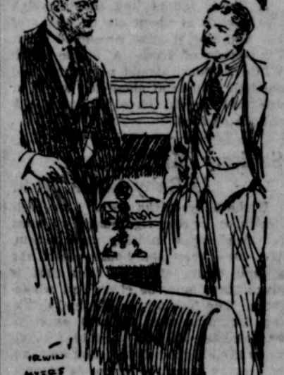
"How Came You to Take Such an Unusual Name?" I ventured to Ask Him.

The landlord and landlady were not inclined to any uneasiness or alarm. During our forty-eight hours' stay they had discovered that Mr. Mazaroff