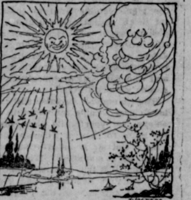
"The Very Idea I Had in Mind."

"Have you any idea how old you are?" asked the King of the Clouds of the Sun. "I haven't," said Mr. Sun. "I really have been so busy all my life that I have never counted the time. I've left that to others. "Besides I don't know arithmetic and I would have to know arithmetic to figure it out." "What's arithmetic and who can do it?" asked the King of the Clouds. "Arithmetic is a lesson they study in school. School is a place where children go to learn about all sorts of things such as how to add two and two and how to spell words. "They learn how to talk beautifully and they find out where they live in the world. "They also study about other places and about the seas and the mountains." "Gracious," said the King of the Clouds, "I am glad I don't have to go to school." "So am I," said Mr. Sun, "but they seem to be quite happy. I suppose