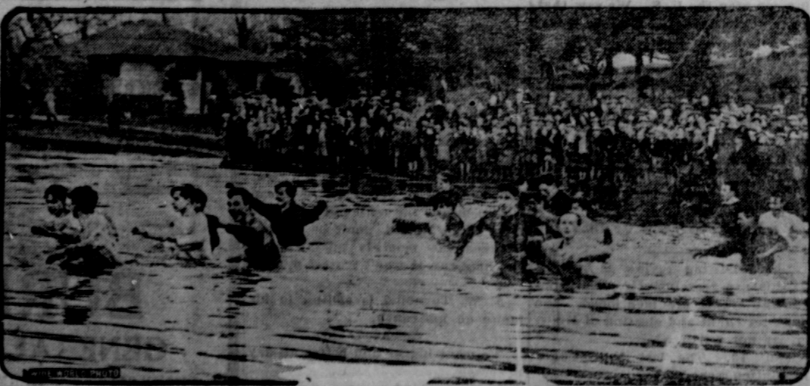
First year students at Clark college, Worcester, Mass., wading through the icy waters of the University park pond as a result of losing their annual tug-o-war to the sophomores.