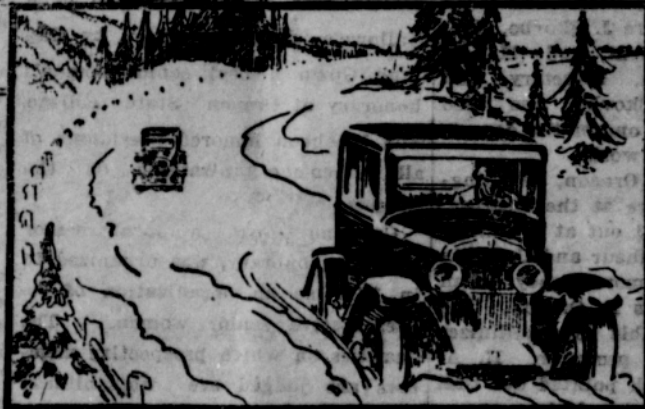
Drawn from a photograph of a car being tested at proving roads.

VISITORS to General Motors' 1268-acre Proving Ground marvel at the sight of a complete weather bureau and ask what it is for.