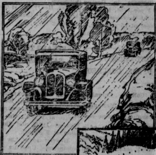
Testing a car's performance in heavy rain. From actual photograph.