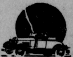
NEW FORD ROADSTER

There is nothing quite like the new Ford anywhere in design, quality and price