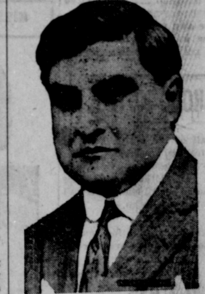
Emilio Portes Gil, who was elected provisional President of Mexico by the congress, to take office on December 1.