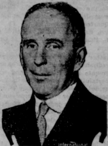
John J. Raskob of Delaware and New York, who was elected chairman of the Democratic national committee and is directing the Smith-Robinson campaign. He was head of the financial committee of the General Motors corporation.