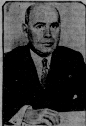
Col. Herbert H. Lehman, a New York banker, was elected director of finances of the Democratic national committee, succeeding Jesse Jones of Houston.