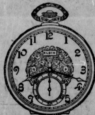
MAN'S POCKET WATCH

THE new square models are now the "go" with "he-men," and you'll find them here, as well as a complete choice of the Nationally Known Makes $12.50 AND UP