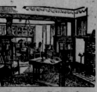
Mantles, Colonades, Sideboards, Cupboards