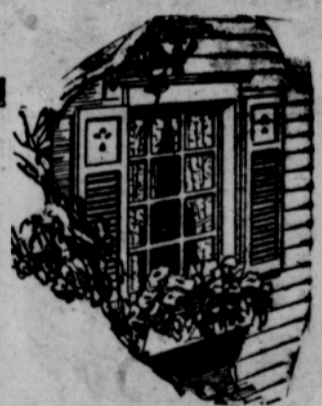
Windows, Casement Sash Blinds, Flower Boxes—and—