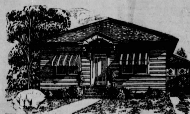
"THE FORD" 3 or 4 rooms—bath—nook—basement. Material cost about the same as Ford car.