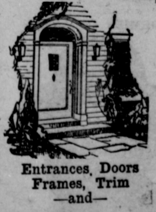
Entrances, Doors Frames, Trim—and—