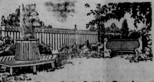
Garden Fence, Seats, Lattice, Pergolas