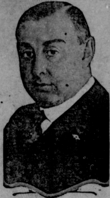
W. H. Thompson, republican, who was elected mayor of Chicago, defeating W. E. Dever, democrat.