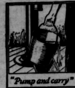
"Pump and carry"