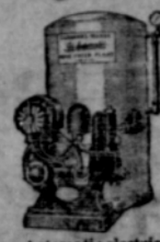
Automatic electric home water plant. 125 to 100 gallons per hour. Engine or motor driven. In permanent water systems, 500 to 1,000 gallons per hour.

Whatever your source of water supply—whatever capacity you require—whether you need an engine or motor driven plant—whatever price you wish to pay—there is a Fairbanks-Morse Home Water Plant that will give you dependable service and greater value per dollar. Let us prove it.