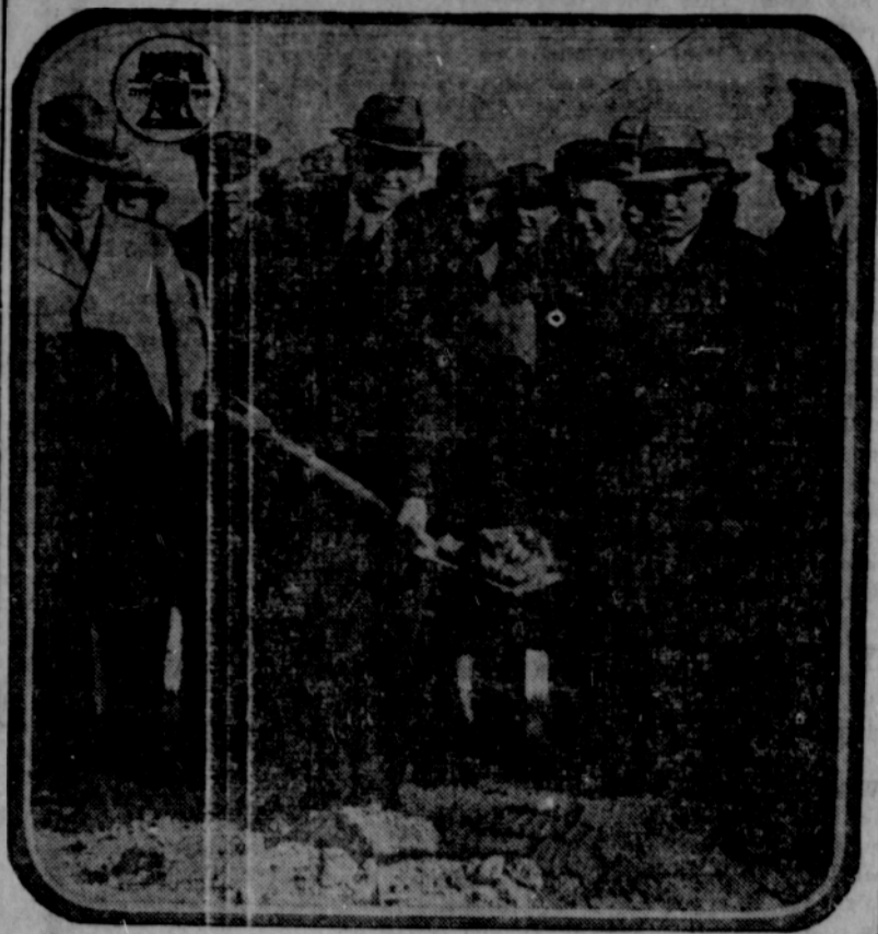
The Secretary of Commerce turns up first spadeful of dirt at ground-breaking ceremonies for emergency hospital on the grounds of the Sesqui-Centennial International Exposition in Philadelphia. The exposition will commemorate the 150th anniversary of the signing of the Declaration of American Independence. At the cabinet member's right is Mayor Kendrick of Philadelphia. The hospital will be conducted by physicians and nurses from the Philadelphia General Hospital.