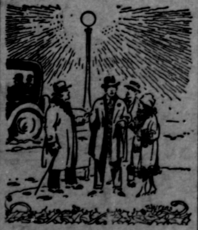
Groups of Carolers Stood at Street Corners and Sang.

B EACON HILL was ablaze with candles in every window. They gleamed through the glass panes of the doorways. Tall candles, short candles, candles of every size and color. For was it not Christmas Eve? And is it not a custom to make merry at this special time in a very charming way?