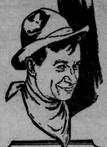
Another "Bull" Durham advertisement by Will Rogers, Zigfield Folins and screen star, and leading American humorist. More coming. Watch for them.