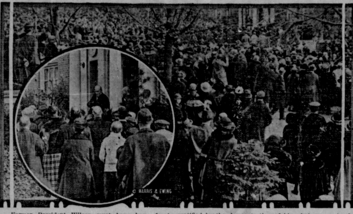
Former President Wilson must have been deeply gratified by the demonstration of his admirers on Armistice day. Thousands of them, including delegates from various organizations and visitors from New Jersey and Virginia gathered in front of his residence in Washington and heard him make a short but vigorous talk from his doorstep. The photograph shows part of the big crowd and, inset, Mr. Wilson at his door.

Interest 12 per cent; Year's Tax 1918, Date Paid August 3, 1921, Amount $12.66, Rate of Interest 12 per cent; Year's Tax 1919, Date Paid August 3, 1921, Amount $15.76, Rate of Interest; Year's Tax 1920, Date Paid August 3, 1921, Amount $18.55, Rate of Interest 12 per cent; Year's Tax 1921, Date Paid March 29, 1922, Amount $64.66, Rate of Interest 12 per cent.