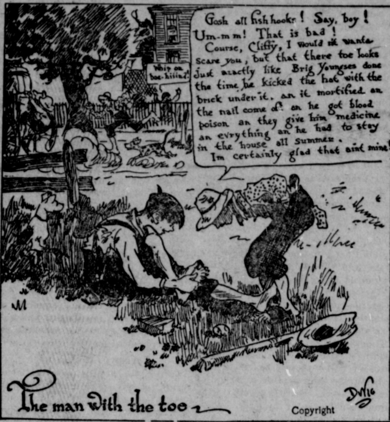
The man with the too Copyright