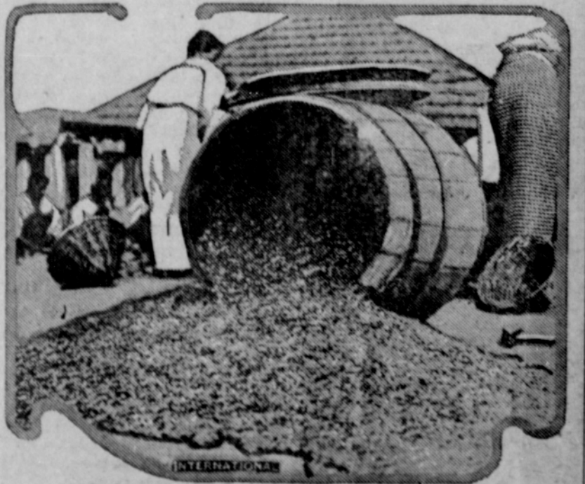
The island of Ceylon produces most of the graphite used by the world in the manufacture of lead pencils, paint, stove blacking, lubricants, crucibles and foundry facings. The methods used in the mining of the mineral in Ceylon are primitive, natives only being employed in the work. The Ceylon graphite is over 98 per cent pure carbon. It is also commonly known as "black lead." The above photograph shows native women working over a barrel of graphite at Colombo, Ceylon.