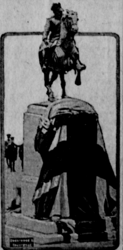
King George of England unveiled his statue of his father, King Edward VII in London recently. The monument stands in Waterloo place.