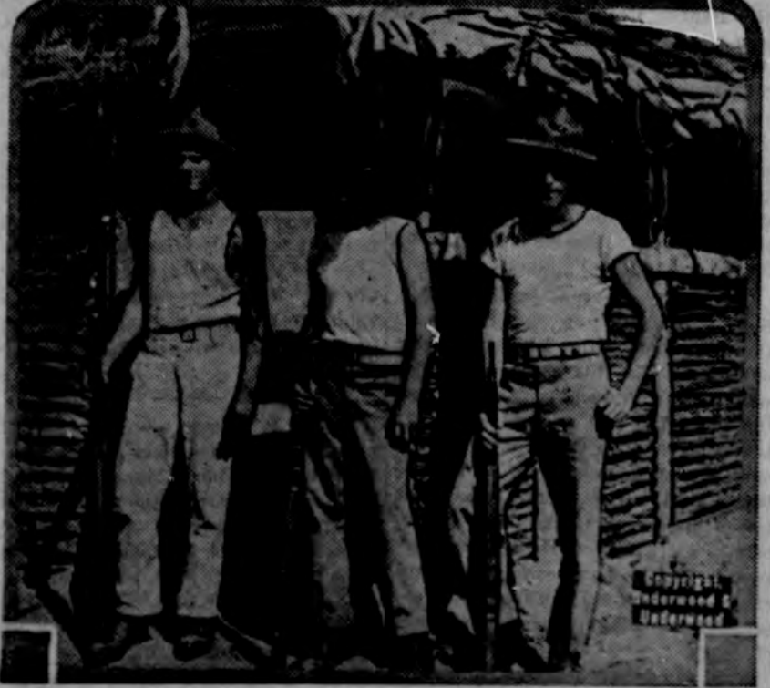
Senator Hiram Johnson has introduced a resolution calling for a senate investigation of the "invasion" of Haiti by the United States. The photograph shows an outpost of American marines in the hills of the island republic.