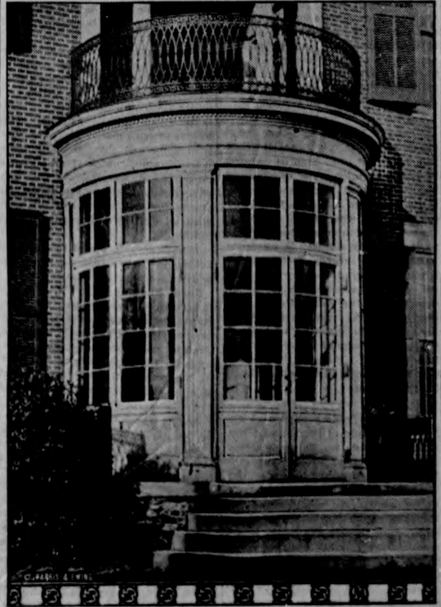
This is the south portico of Ex-President Wilson's new home at 2340 S street, Washington, where he may continue his almost daily sun baths. The portico overlooks a spacious garden with a fountain in the center.