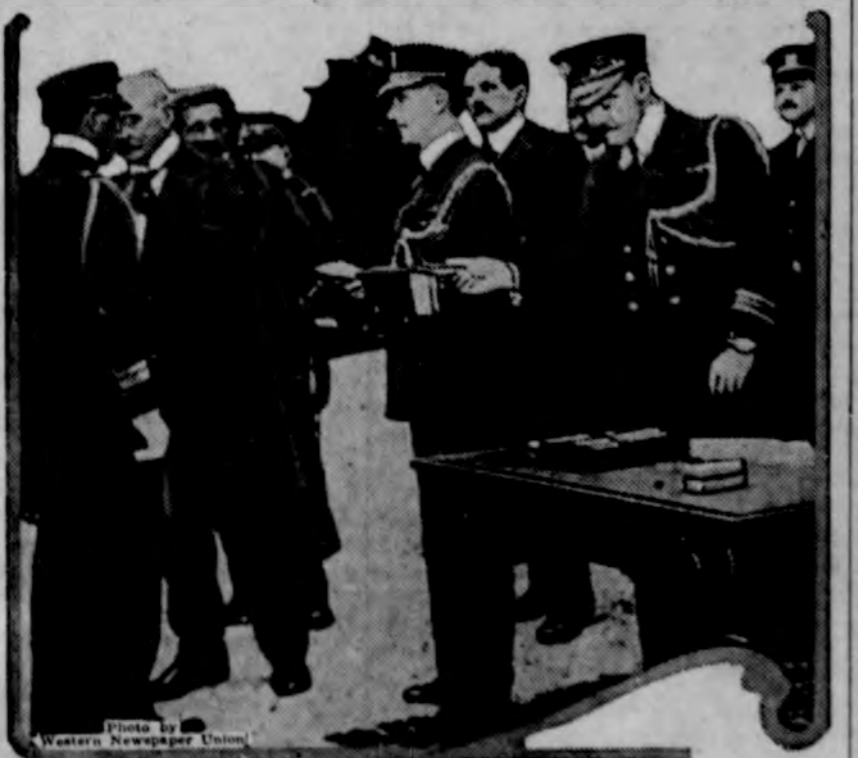
American ambassador Hugh Campbell Wallace, in the name of the United States government, presenting distinguished services and navy crosses to about one hundred officers of the French army and navy. The presentation was made in the gardens of the American embassy in Paris.