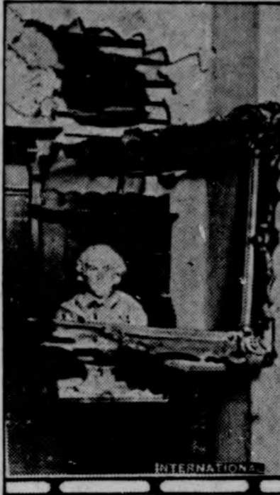
During the spectacular fire on an ammunition barge at Fort Hamilton, a 10-inch shell crashed through the wall of a house a mile away and plunged down to the cellar. Fortunately the family were all out watching the fire.