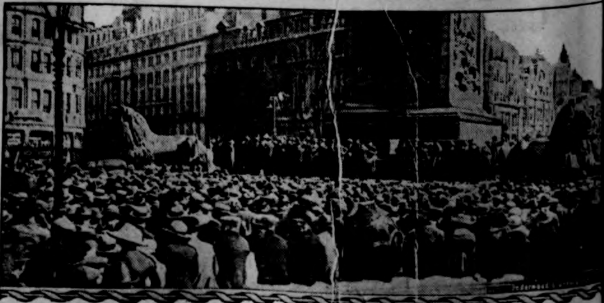
General view of the enormous crowd at Sinn Fein demonstration in Trafalgar square, London. Many speakers addressed the multitude.