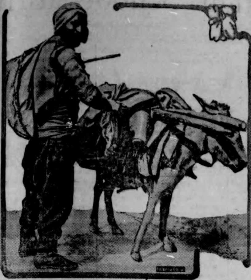
A shopping trip for the peasants of Serbia means something more than calling the corner grocery on the phone or a few hours in the town shops. Usually it consists of a day's trip across country, a day of bargaining in the markets and another day to return home. Towns are few and widely scattered and transport facilities are almost unknown. This photograph shows a peasant on the way to market with the usual equipment.