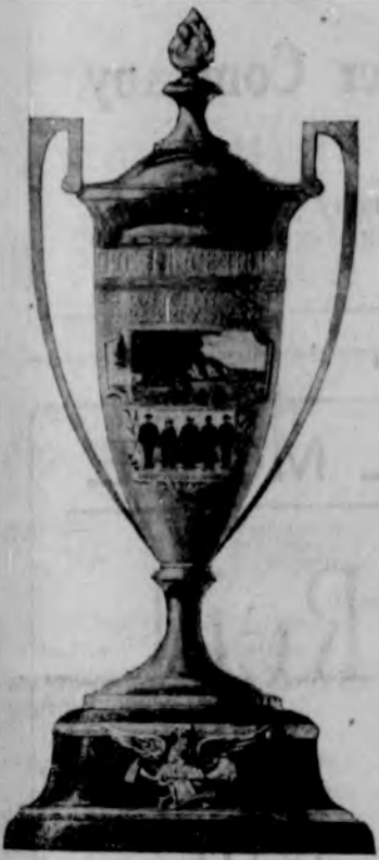
Thos. H. Ince Trophy

Thos. H. Ince, proprietor of the Pace Moving Picture Studios, hearing of this contest and desiring to give all the aid and encouragement possible, has not only produced an educational film to instruct the public