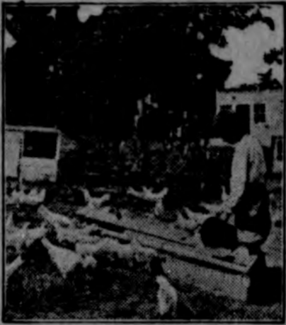
Club Boy Feeding His Flock.

A net return of $2 a hen over a four-months' period is the remarkable record of a North Carolina poultry club member who, about the middle of January, mated 15 White Leghorn hens with a standard-bred male of the same variety. During the ensuing four months these 15 hens laid 1,108 eggs. Of this number 50 were placed in the incubator, from which 41 chicks were hatched and all but five were raised. The owner marketed six cockerels for $3.60. He now has on hand 30 pullets. He sold 304 eggs for hatching purposes for $30.50, as well as 54 1/2 dozen mar-