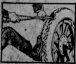
You can't pull the tread off a Thermoid Tire.

One Thermoid Crolide Compound Tire will prove to you its resistance to the attacks of oil, water, heat and similar agencies which weaken tires and lead to blowouts. Guaranteed 6000 miles (Ford size 7500).