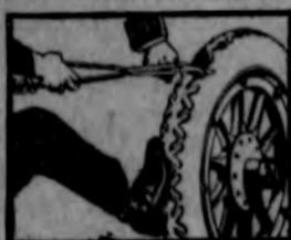
You can't pull the tread off a Thermoid Tire

This process adds strength and elasticity to the fabric and rubber and has done much in combating the stone bruise, tread separation, blowouts, and all common evils that make tires short lived.