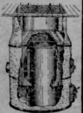
Arrows show direction of air currents

Has no pipes, no bulky cold air returns. Your walls are not torn up, no cellar is too small. Will burn any fuel. Particularly adapted to soft coal. Special humidifier keeps the air always moist. The furnace is built of heavy boiler plate steel, no cemented joints to leak gas, dust or soot. Fire pot lined with high-test fire brick, capable of withstanding 3500 degrees of heat. An abundance of clean, pure warm air sent to every room. Simpler than a stove to operate, cleaner, more saving of fuel, and much more healthful. Sends heat to every room in the house. Ventilates as well as heats. Changes and purifies the air to every room. Keeps the cellar cool for fruit and vegetable storage.