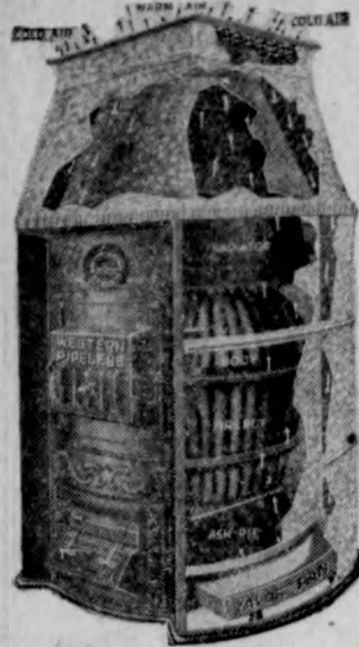
The "WESTERN" The Pipeless Furnace