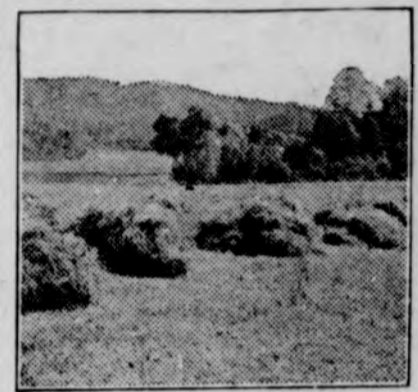
Curing Hay in Bunch—Hay Will Cure Out Better When Loosely Bunched Than When in Swath or Windrow, but a Heavy Rain Will Wet It Clear Through.

It has been found that the yield of a timothy crop coming into bloom was 3,411 pounds of dry matter to the acre; the yield at full bloom was 5,433 pounds; the yield when seed was