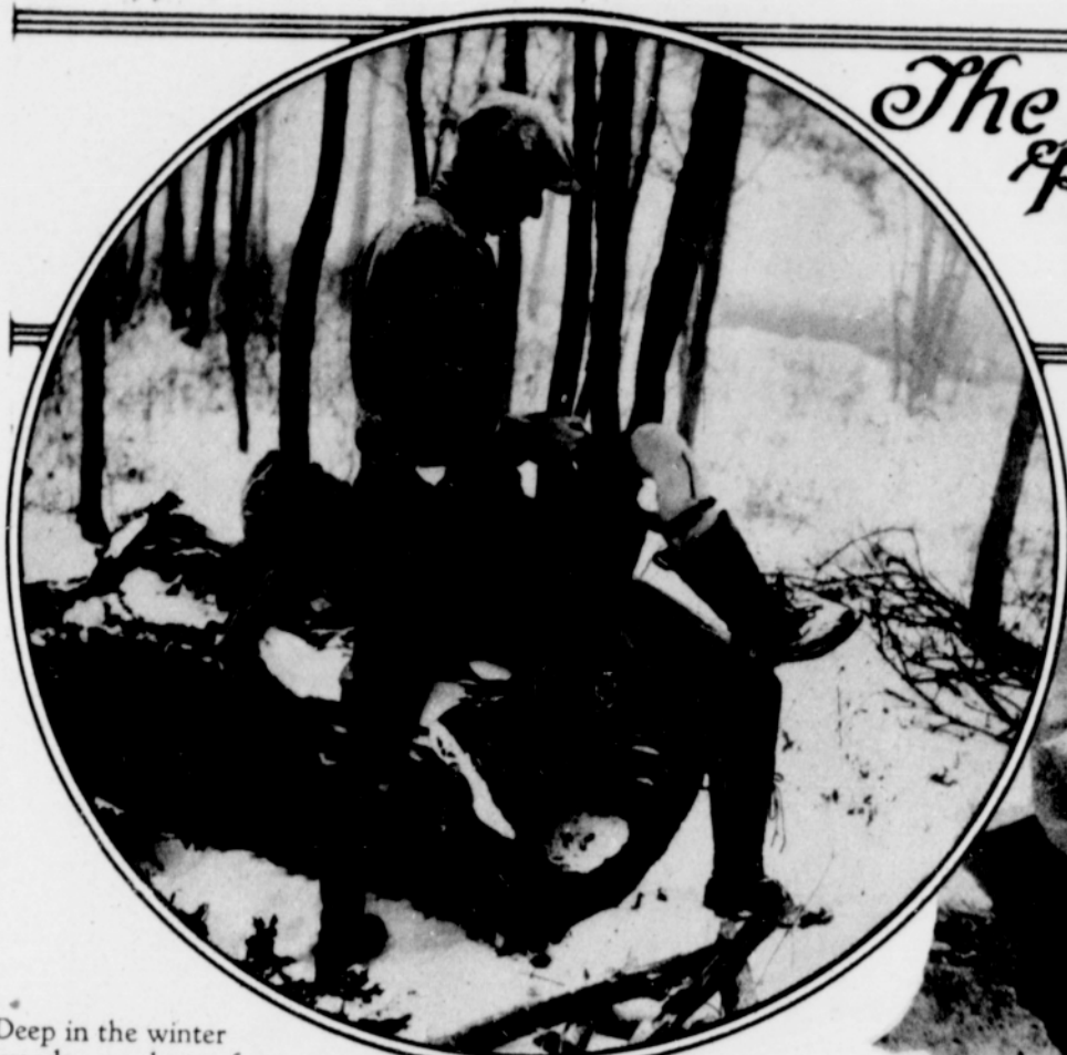
Deep in the winter woods—no doctor for miles—knowledge of Red Cross First Aid will save life. More than 40,000 men and women qualified for First Aid certificates the past year.