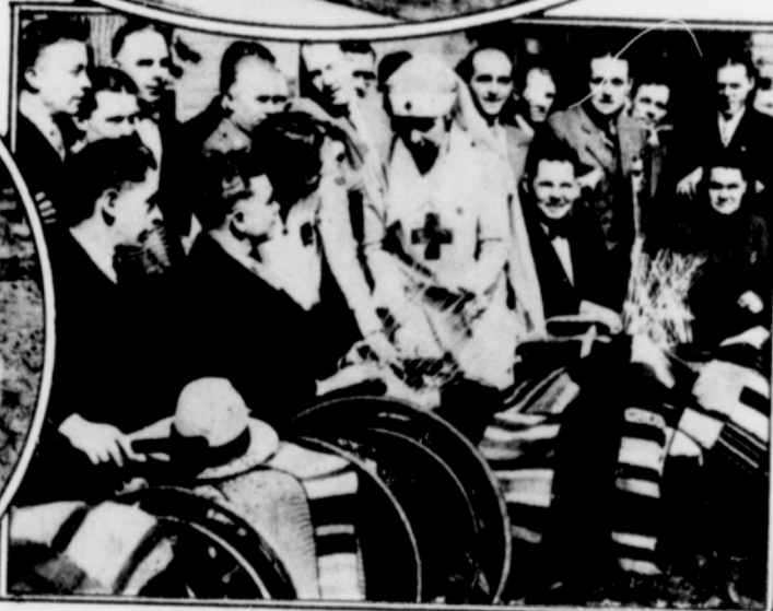
TEN YEARS AGO—AND TODAY—(OVAL) Hot chocolate from a Red Cross outpost canteen hit the right spot with these wounded doughboys in 1918. (LEFT) A Red Cross canteen "over there." (RIGHT) Mrs. Coolidge, as a Red Cross volunteer, cheers disabled and sick World War veterans, 25,000 of whom are in hospitals today.