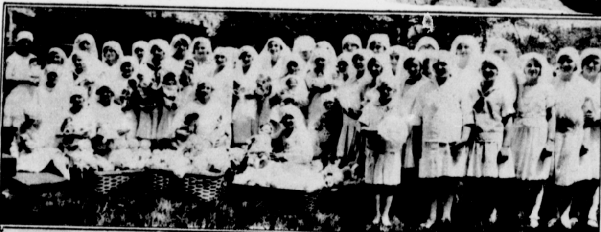
These Junior Red Cross members, whose motto is "I Serve," dressed 500 dolls and distributed them to children ill in hospitals.