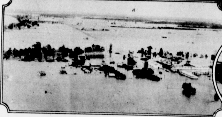
The disaster relief forces of the American Red Cross have been in action continuously for more than a year aiding those overwhelmed by catastrophe. Floods and tornadoes have been the principal agencies of destruction.