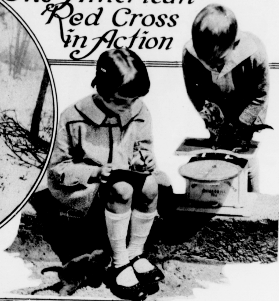
The young nutrition experts will now give Kitty proper food. They are recording Kitty's weight just as theirs was recorded in the Red Cross nutrition class.