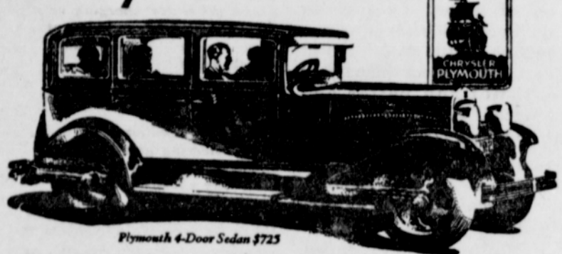
Plymouth 4-Door Sedan 7723

AMERICA ACCEPTS AND ACCLAIMS THE NEW PLYMOUTH