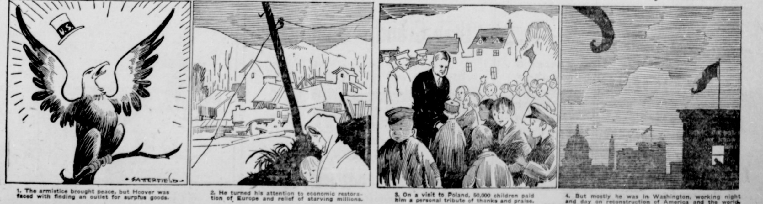
1. The armistice brought peace, but Hoover was faced with finding an outlet for surplus goods. 2. He turned his attention to economic restoration of Europe and relief of starving millions. 3. On a visit to Poland, 50,000 children paid him a personal tribute of thanks and praise. 4. But mostly he was in Washington, working night and day on reconstruction of America and the world.