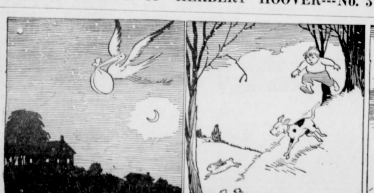
1. On Aug. 10, 1874, Herbert Clarke Hoover was born in West Branch, Iowa. He had one brother and a sister.