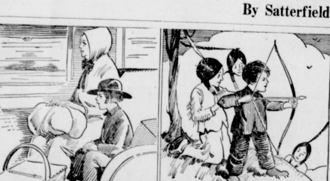
2. As a boy, Herbert loved all sports and outdoor pastimes. In winter he delighted in snow sports.