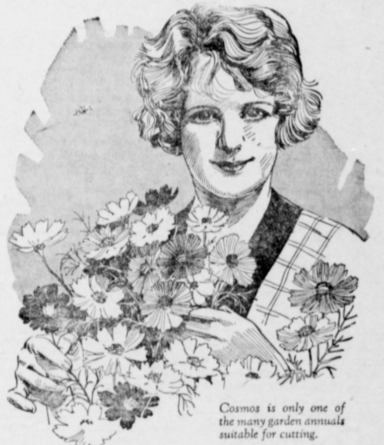
Cosmos is only one of the many garden annuals suitable for cutting.