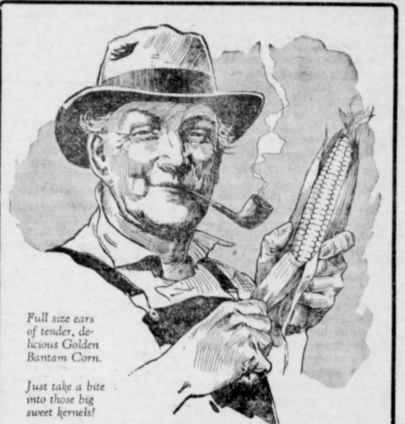
Full size ears of tender, delicious Golden Bantam Corn.

Two lines, two phones, at your service for news, ads, subscriptions and printing.