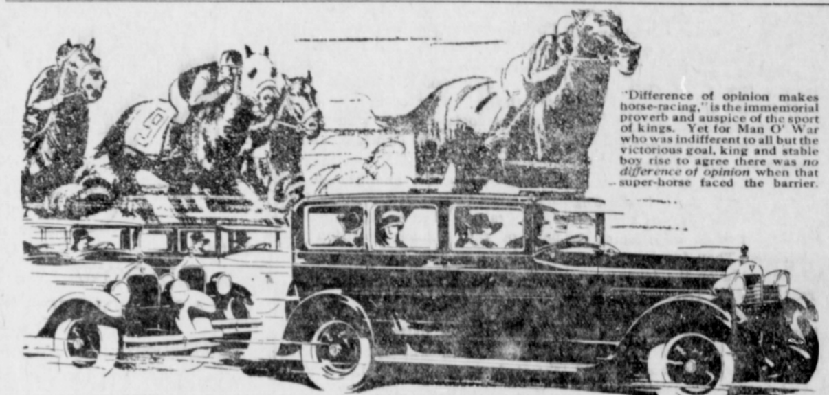
"Difference of opinion makes horse-racing," is the immemorial proverb and auspice of the sport of kings. Yet for Man O' War who was indifferent to all but the victorious goal, king and stable boy rise to agree there was no difference of opinion when that super-horse faced the barrier.