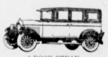
4-DOOR SEDAN $1455 at Gresham

—52 and more miles an hour. Acceleration and smoothness no other low-priced car can approach. Full-sized bodies of wood and steel, with ample capacity for adult passengers. Saddle-spring seat-cushions. Fine mohair upholstery. Utmost handling ease with adjustable steering wheel. Indirectly lighted instrument board. The various models, delivered at Gresham are priced as follows: COUPE, $895; SEDAN, $975; COACH $910; ROADSTER, with rumble seat $895.